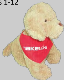
Soft cuddly dog with Takeuchi neck tie/ bandana