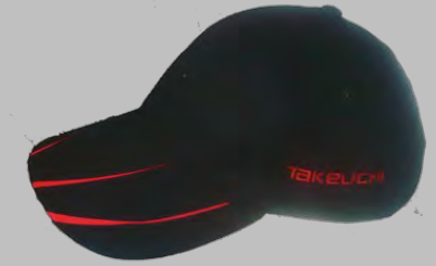
Black Takeuchi cap with two tone peak, logo embroidery to both sides of cap, Velcro adjuster for fitting