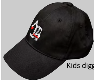
Kids digger cap

Heavyweight waterproof jacket and trouser suit, windproof, zip away hood, zip jacket, adjustable & elasticated.