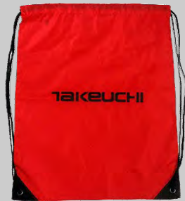
Red/ black drawstring bag