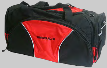
Black and red sports bag with removable shoulder strap & zip pockets to each side