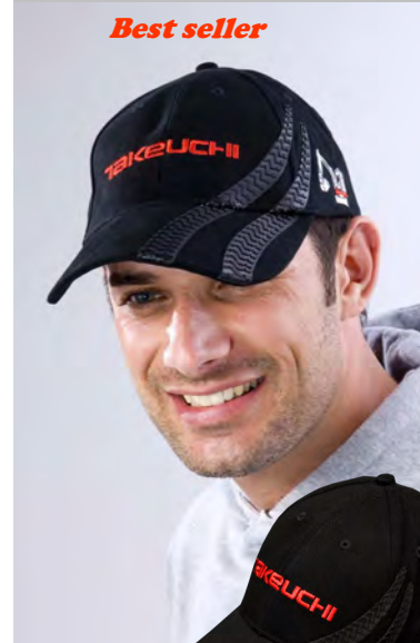
Black Takeuchi track cap, rubber tracks on peak with logo to front, velcro adjuster for fitting

Get wrapped up for site Takeuchi have a range of headwear to suit all