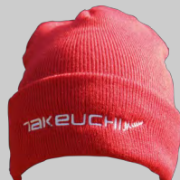
Junior knitted red hat