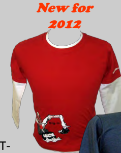
New for 2012

Children's black T-shirt. 100% ring-spun cotton, generous cut, available in age 1 to 14 years.