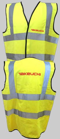
Yellow hi visibility vest