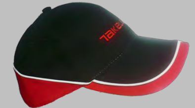
Black ,red & white Takeuchi sports cap, logo embroidery to front, Velcro adjuster for fitting