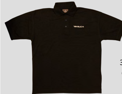
Black polo t-shirt. 100% cotton, 3 woodstone buttons, collar and cuff detail, double stitch seams. Available in sizes: M-XXL